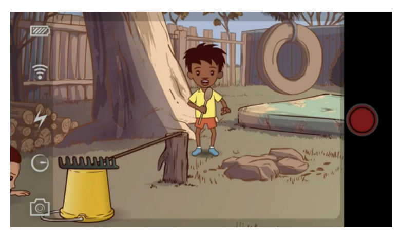
Little J and Big Cuz (2017-) NITV

Stand back with your camera for a wide shot when you want to show your obstacle course or someone attempting an obstacle.