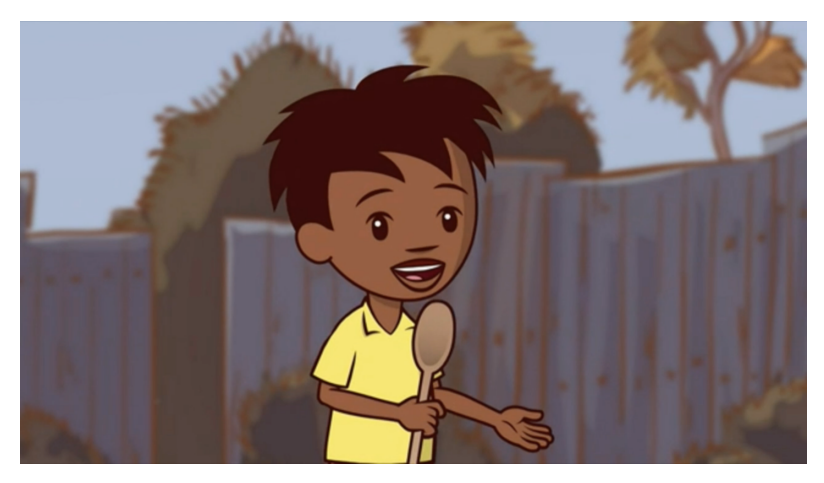
Little J and Big Cuz (2017-) NITV

Use a mid shot (from someone's tummy to just above their head) when someone is talking to the camera or to another character.